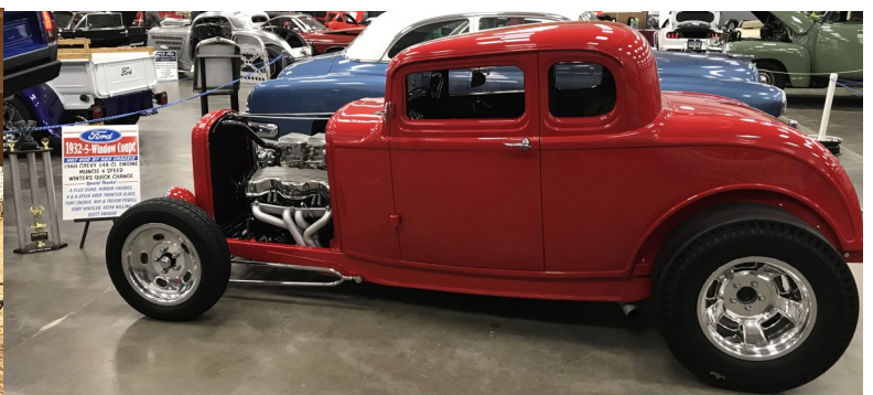
Randy Baumiller's '32 Ford 5 window coupe took best Hot Rod.