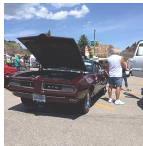
Another nice Pontiac GTO