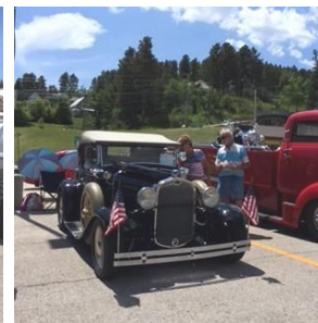
Cool Model A roadster