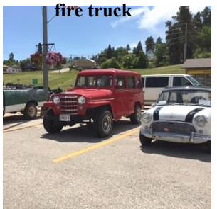
Here's an example of real diversity