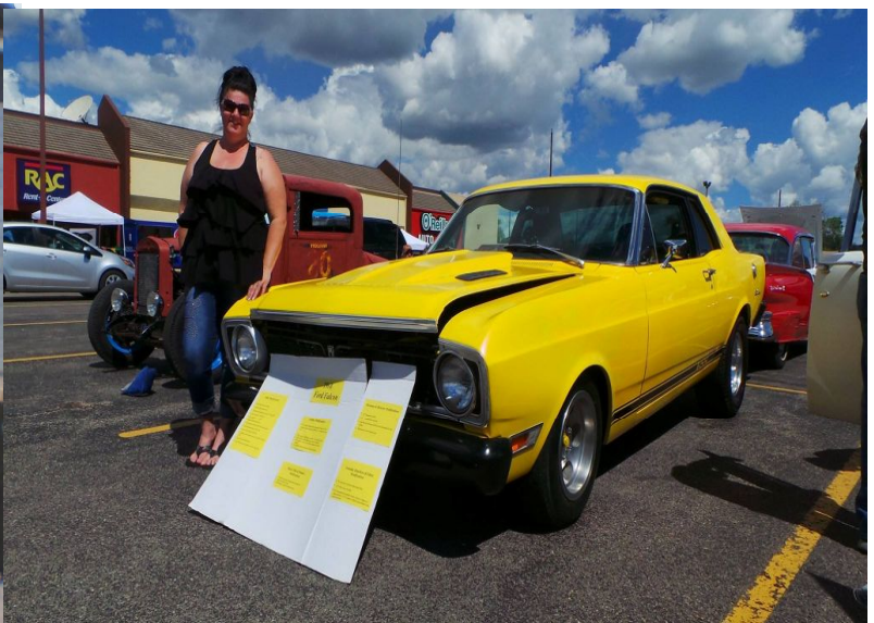
Here are some before and after shots of Dani Church's Lima Bean Falcon which sprouted into a full fledged Big Bird.