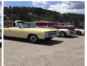
Denny Vollmer's '65 Chevelle is too cool.