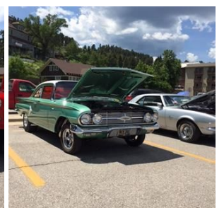
Street/strip '59 Chevy