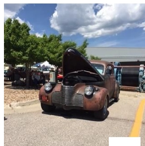
Here is a cool 'Rat Rod' '40 Chevy was For Sale!