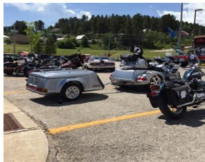
A variety of nice motor cycles added variety

Notable winners were Jim Strathan, whose '41 Willys coupe won Best