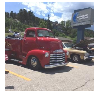
My favorite, 1948 COE fire truck