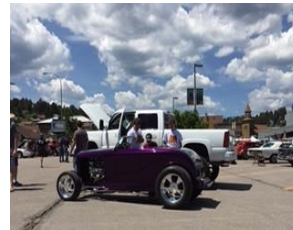
Ford roadster still looks good.