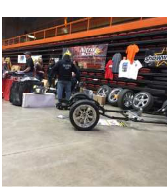
Dahlman's Camaro shop