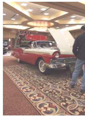
One of 2 '57 Ford retractable