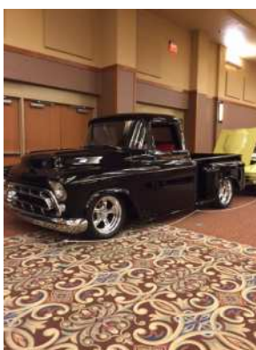
One fine '55 Chevy Pickup

Thanks to all that watched doors all weekend! JN