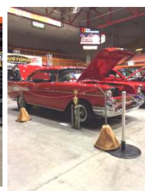
Very nice 1957