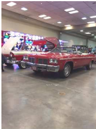
The Gold Dust Club display

RMS Screen Printing sold car show T shirts