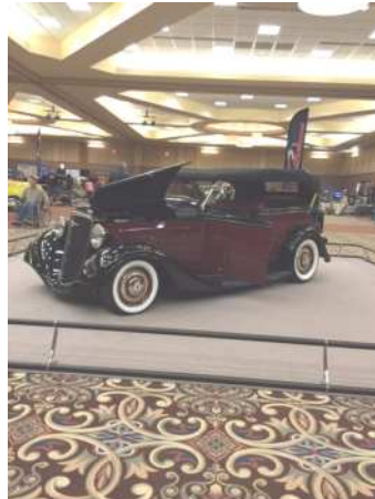
The "Black Bow Tie" 1935 Chevy was another "Americas Most Beautiful Roadster" 2014 and was a feature car