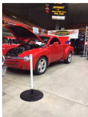
"Cool" SSR Chevy PU